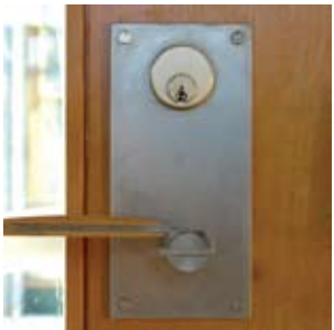
Image 4 (#207-32D)