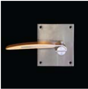
Image 1 (#201-32D)